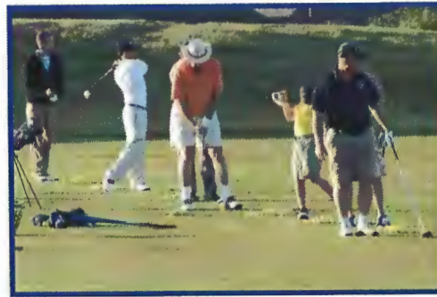
Military Men and Women From Ft. Hood Are Invited to Play